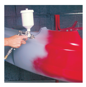
Step 3. Allow Bumper & Cladding Coat Adhesion Primer to dry 60 min. at 72°F (21°C) or 15 min. at 130°F (54°C). No sanding or scuffing of primer required. The primer can be topcoated at any time after it has dried completely. In other words, the "window does not close." Apply basecoat directly over Bumper & Cladding Coat Adhesion Primer, then clearcoat. Topcoat only with approved base-clear paint system. Do NOT topcoat with catalyzed basecoats, single-stage urethane paint, 2K primer surfacers, 2K sealers, or waterbornes. Our low VOC formula has much improved topcoat compatibility for these systems.

The paint film on the bumper can be crosshatched with a razor blade, tape tested, and pressure washed with no evidence of basecoat or primer peeling.