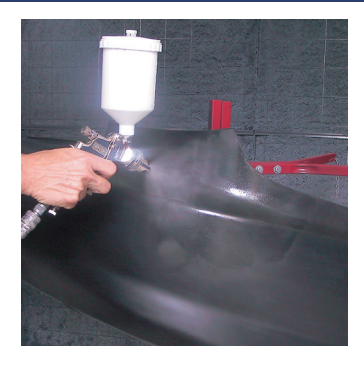
Step 1. Clean plastic with 1000 Super Prep or 1001 EcoPrep Plastic Cleaner. Spray on a heavy, wet coat in an area about one foot square, wait a few seconds, then wipe in one direction with a clean cloth. On raw TPO plastic surfaces, no sanding or scuffing of surface required.

If part is used, or anytime ultimate adhesion is desired, wash first with 1020 Scuff Magic Prep Soap and water using a gray scuff pad. This will clean the surface and create fine sandscratches that will further improve coating adhesion. Rinse thoroughly with water and allow to dry completely. After this, clean with 1000 Super Prep or 1001 EcoPrep as described above.