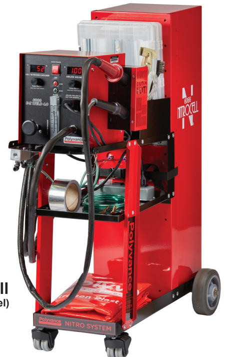
6080-CG Nitrocell (Nitrogen generator model)